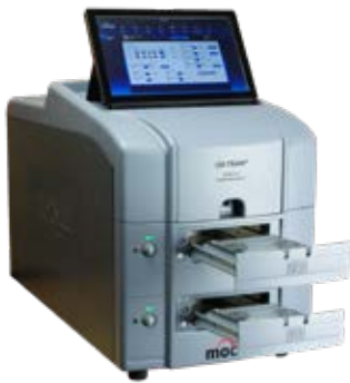
Interchangeable cartridge options such as package adapter, edge effect and reduced area cartridges expand testing capabilities