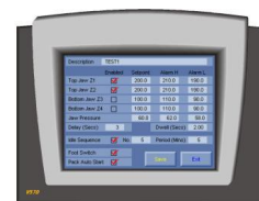
Temperature and pressure calibration screen