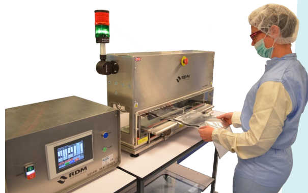
Separate Control Console