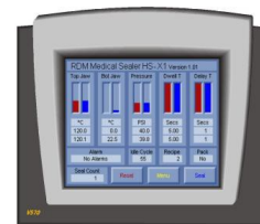
Settings screen for all control parameters